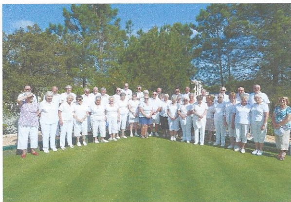
The whole group