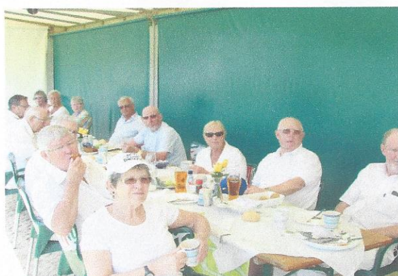
Enjoying the after match buffet