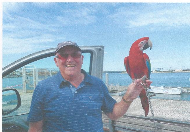
I've heard his jokes before!