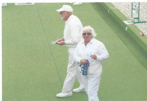
It's Rink One! I'm 31 - 5 down!!