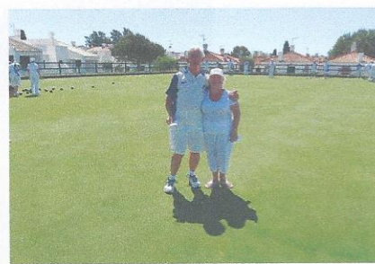
Little & Large!

This evening we went to a local Portuguese restaurant for a meal and Presentation night.