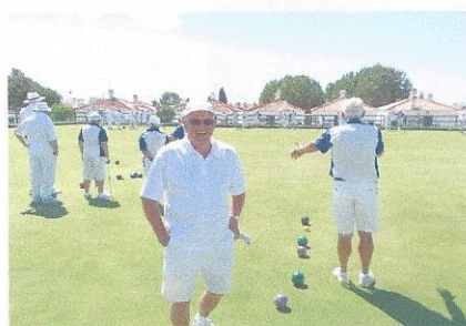
They've taken the right green!